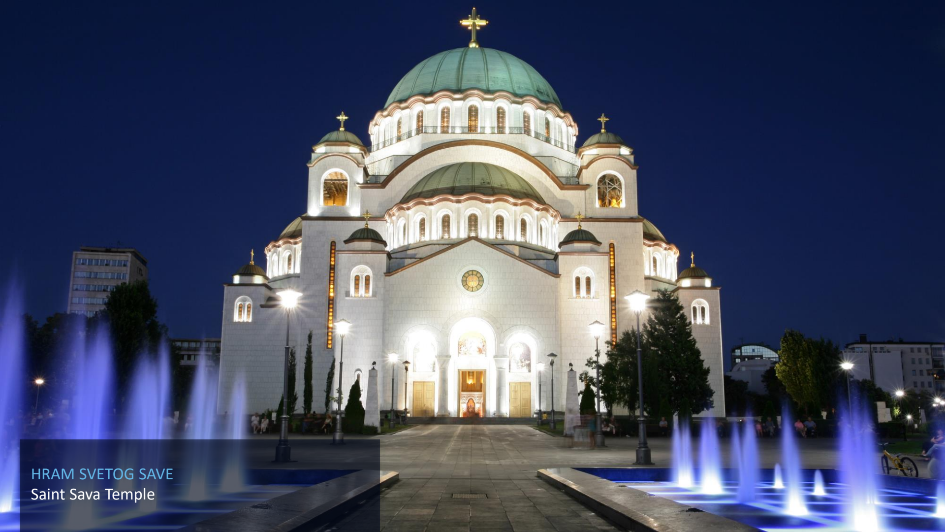
HRAM SVETOG SAVE Saint Sava Temple