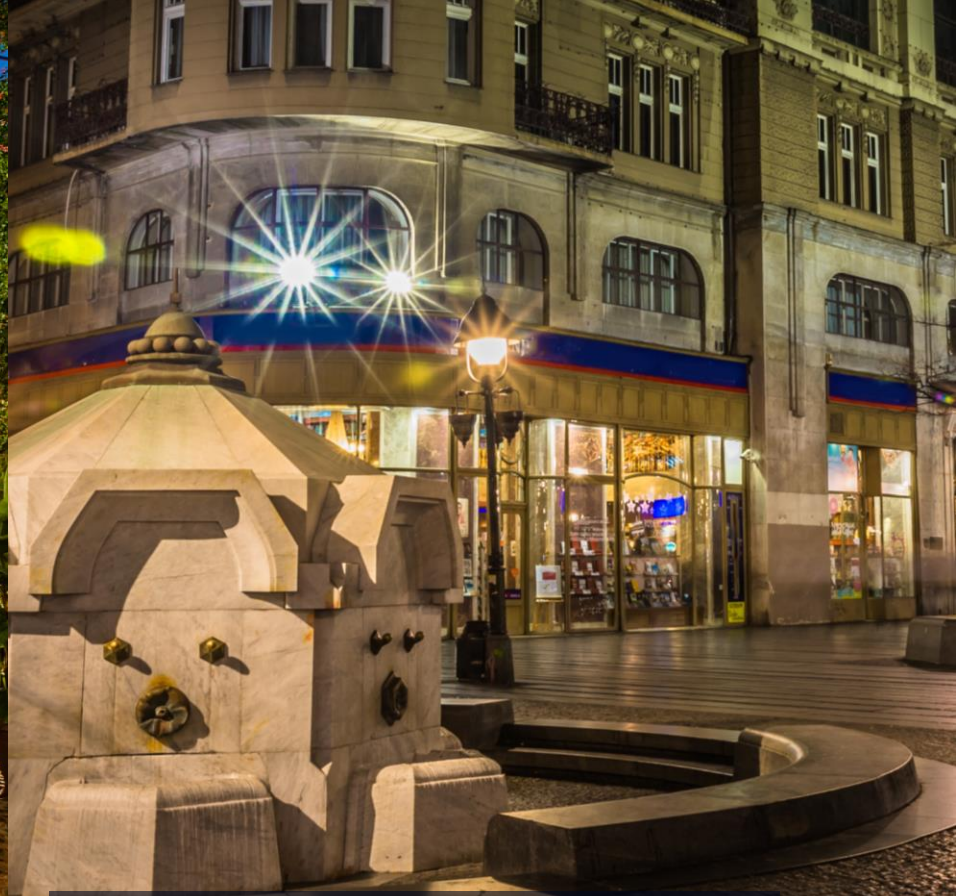
KNEZ MIHAILOVA Knez Mihailova Street