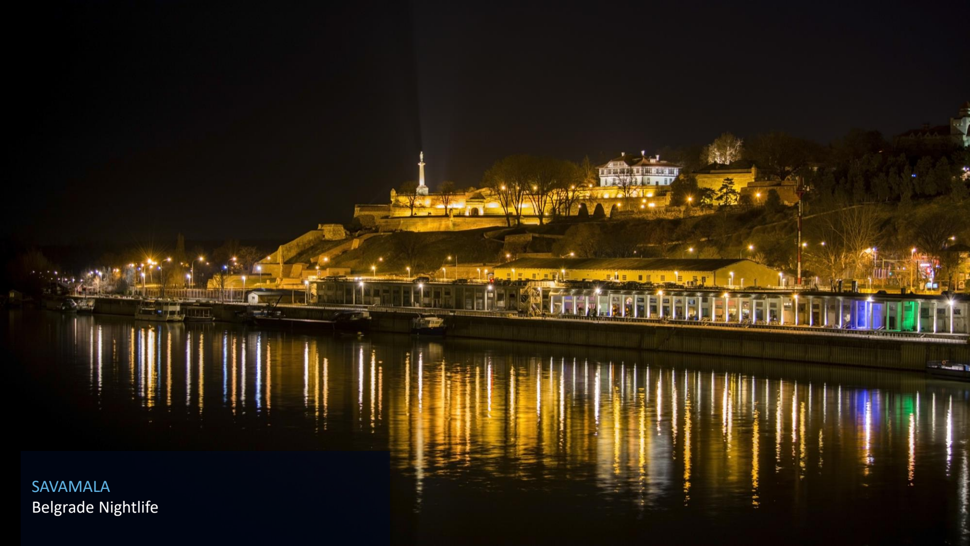
SAVAMALA Belgrade Nightlife