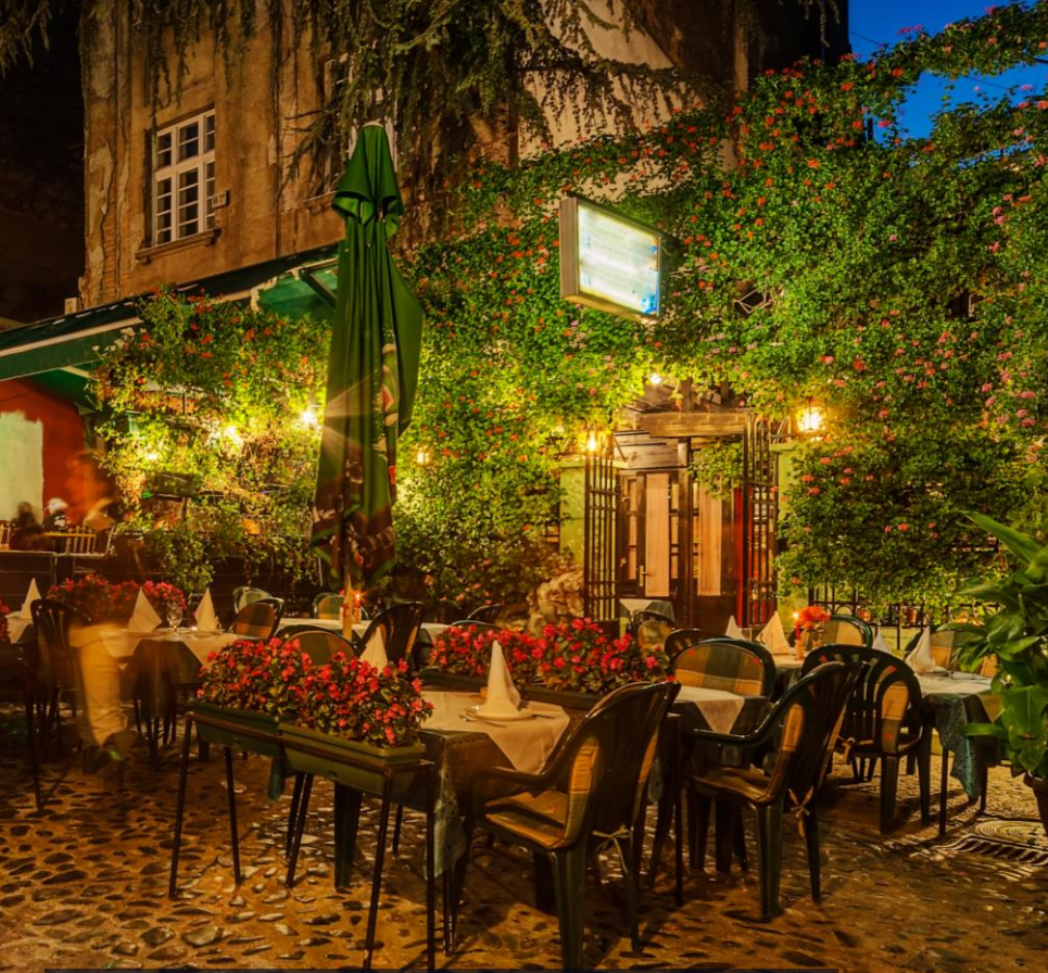
SKADARLIJA Bohemian Quarter