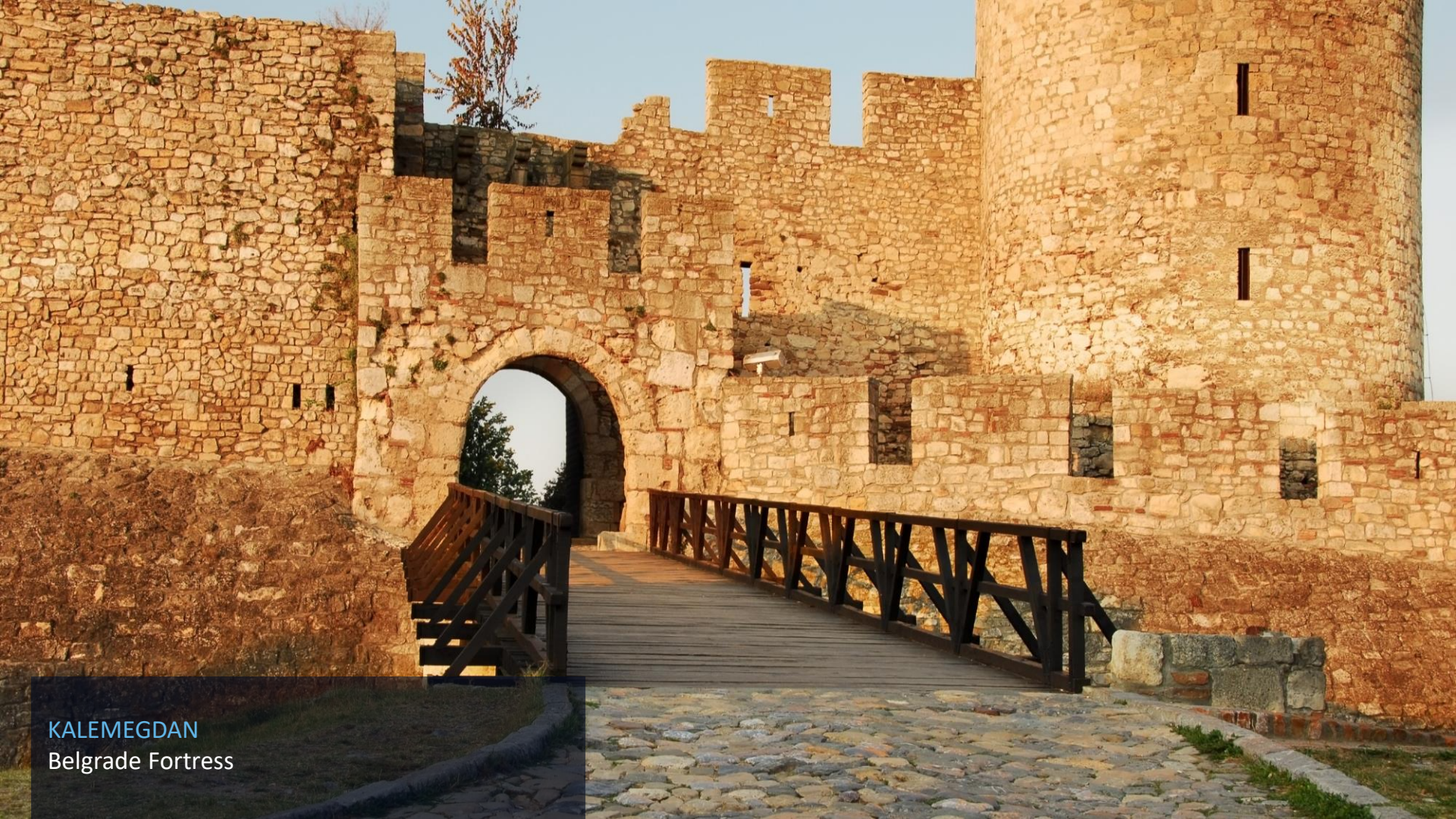
KALEMEGDAN Belgrade Fortress