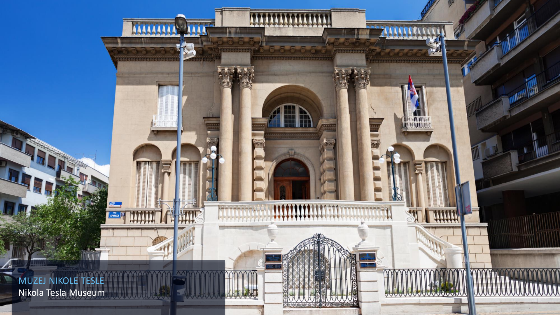
MUZEJ NIKOLE TESLE Nikola Tesla Museum